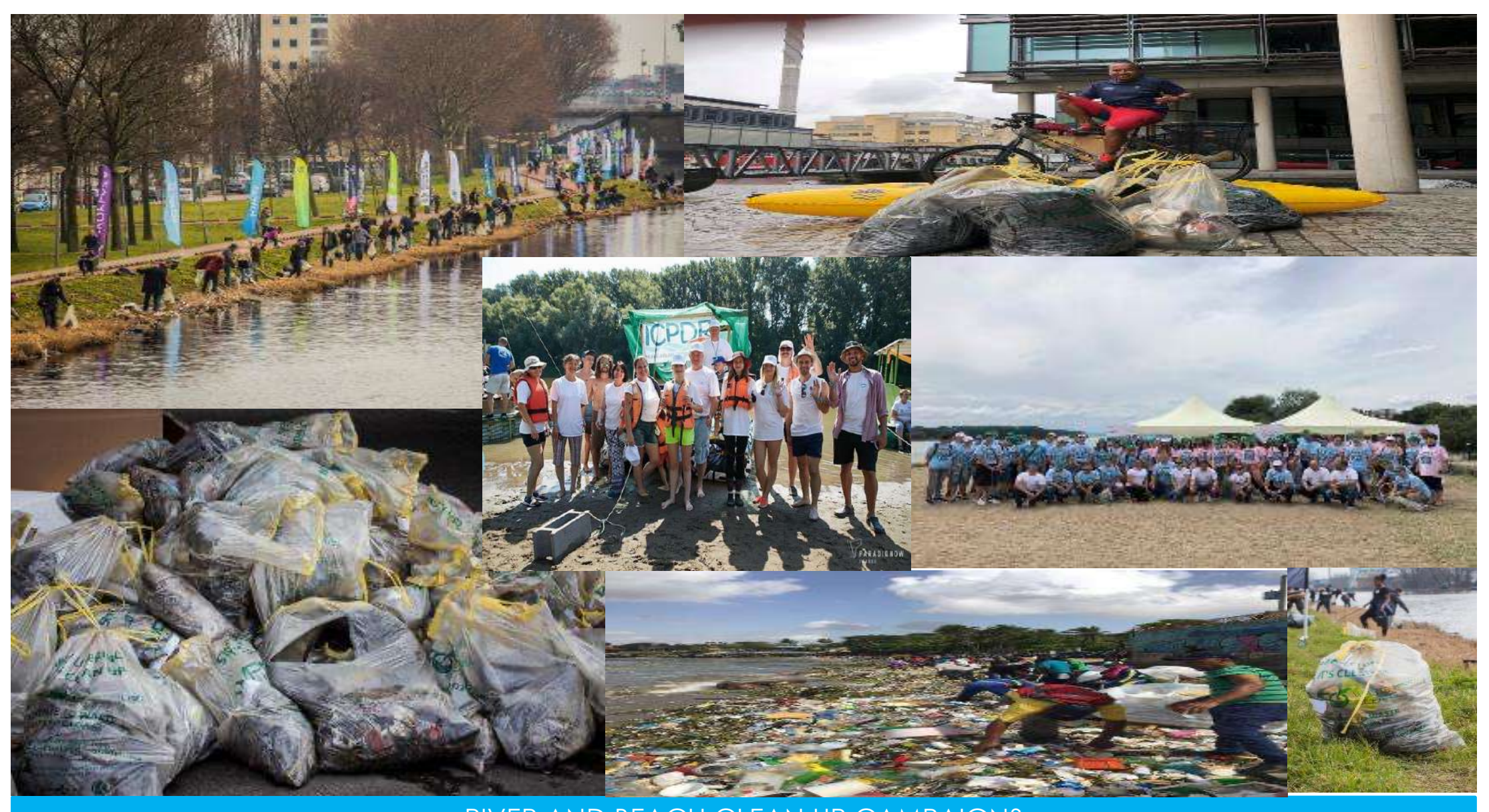
RIVER AND BEACH CLEAN UP CAMPAIGNS